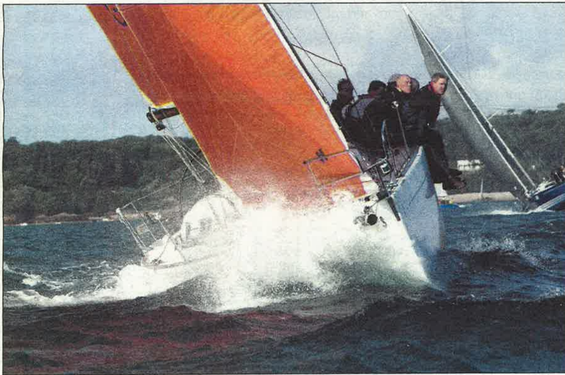
Left: Jackana and crew on the way to an IRC Class One victory